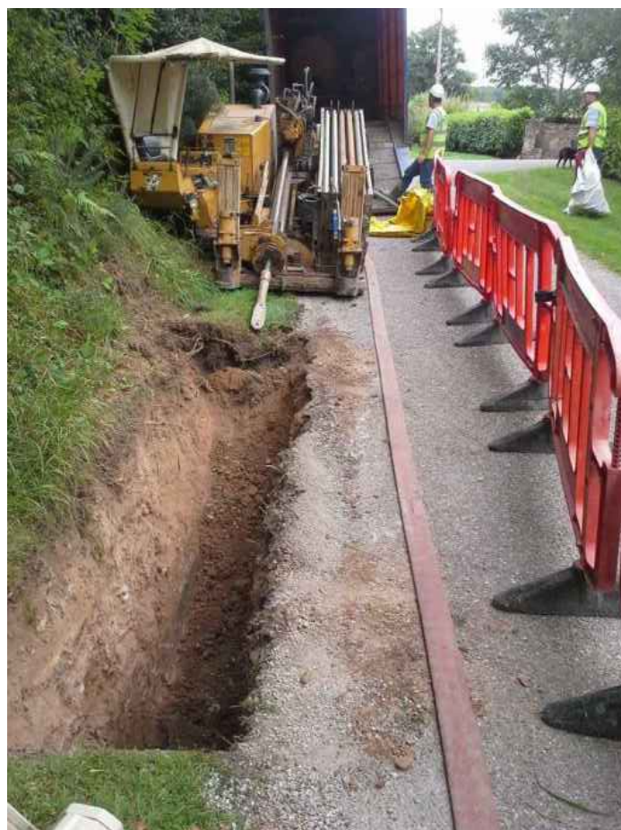
Drilling Rig/Launch Pit