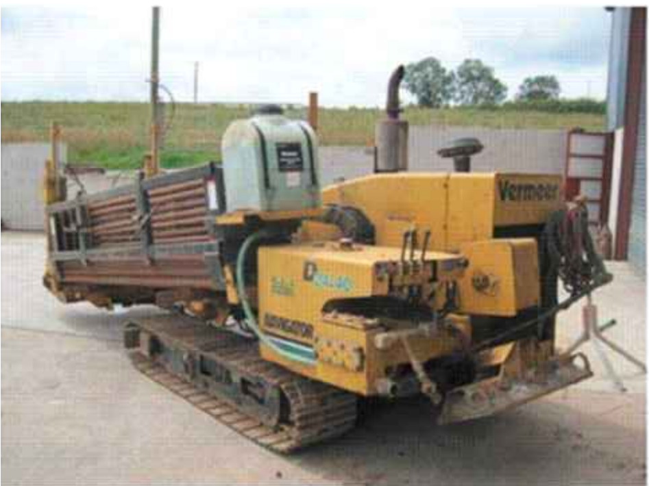
Directional Drilling Rig